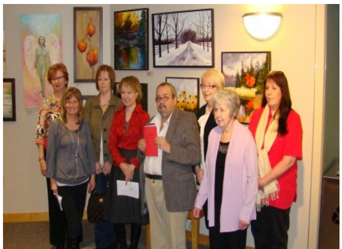
Above—the Haydon Five proudly display their paintings